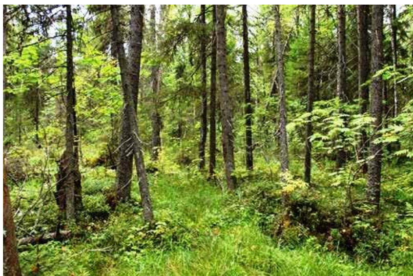
Fig-2. Availability of Medicinal plants in Illuababor Zone and Bunobede Zone